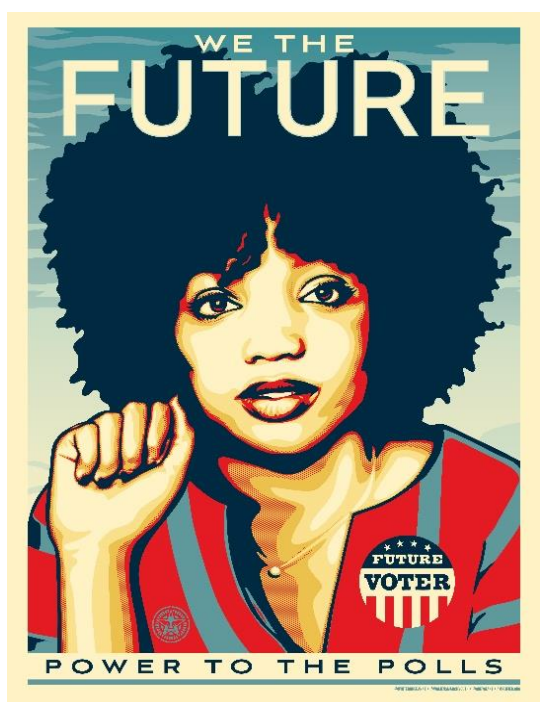
Artwork by Winter Breen and Shepard Fairey for Amplifier.org

The Citizens Redistricting Commission, created in 2008 by California Proposition 11, stands out as a pioneering effort to reduce partisan gerrymandering in California. Previously, lawmakers were responsible for drawing voting districts every ten years which resulted in 99% of incumbents being re-elected each election cycle.8 In 2010, California Proposition 20 expanded the Commission's power to include drawing congressional districts. The Irvine Foundation and VCE grantees put considerable energy